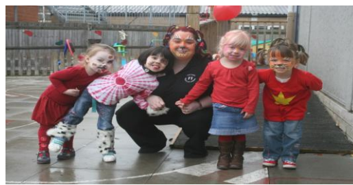
The children and staff came to nursery with crazy hair and hats. The children had fun with face painting and wearing Red noses. Cakes were sold and £86.46 was raised for comic relief